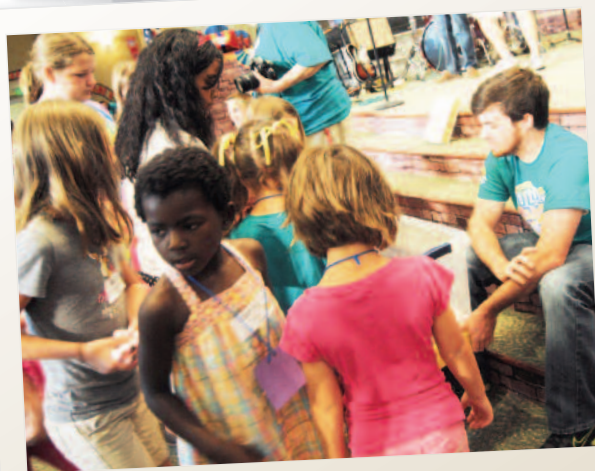
VBS Children bring their offering for Bibles-4-Children