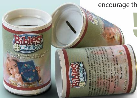
Bibles-4-Children Coin Banks are an excellent visual reminder for children learning to give.