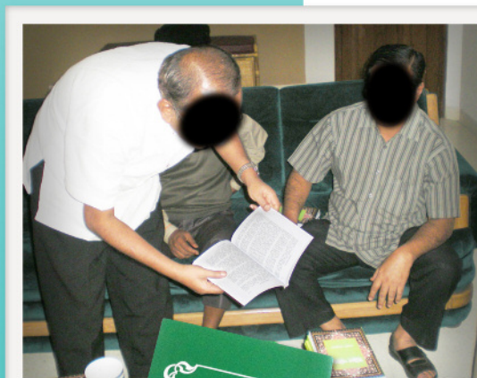
The "Muslim-friendly" translation of the Gospels in Bengali