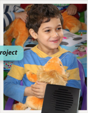
The Lion Project

This is an ongoing project that is yielding tremendous results. Not only are children hearing the gospel and listening to the Bible, but whole families are involved. Our most recent report mentioned three entire families coming to faith in Christ as a result of the Lion Project.