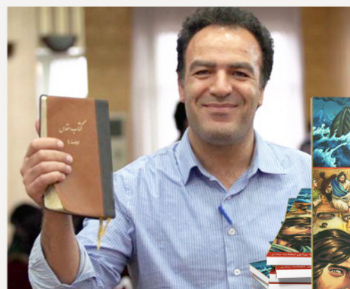
Persian Bibles and Bible Storybooks in Farsi for Iran